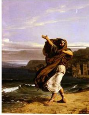
Demosthenes Practising Oratory (1870)