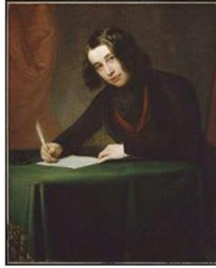
Charles Dickens (1842)